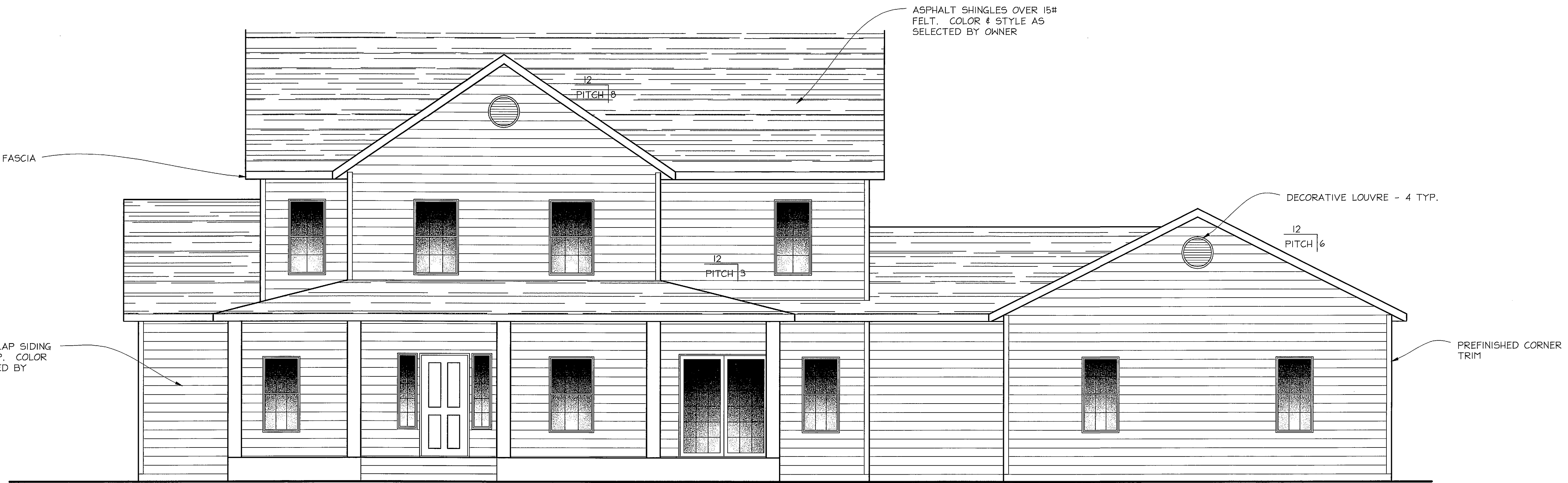
WEST ELEVATION SCALE: 1/4" = 1'-0"