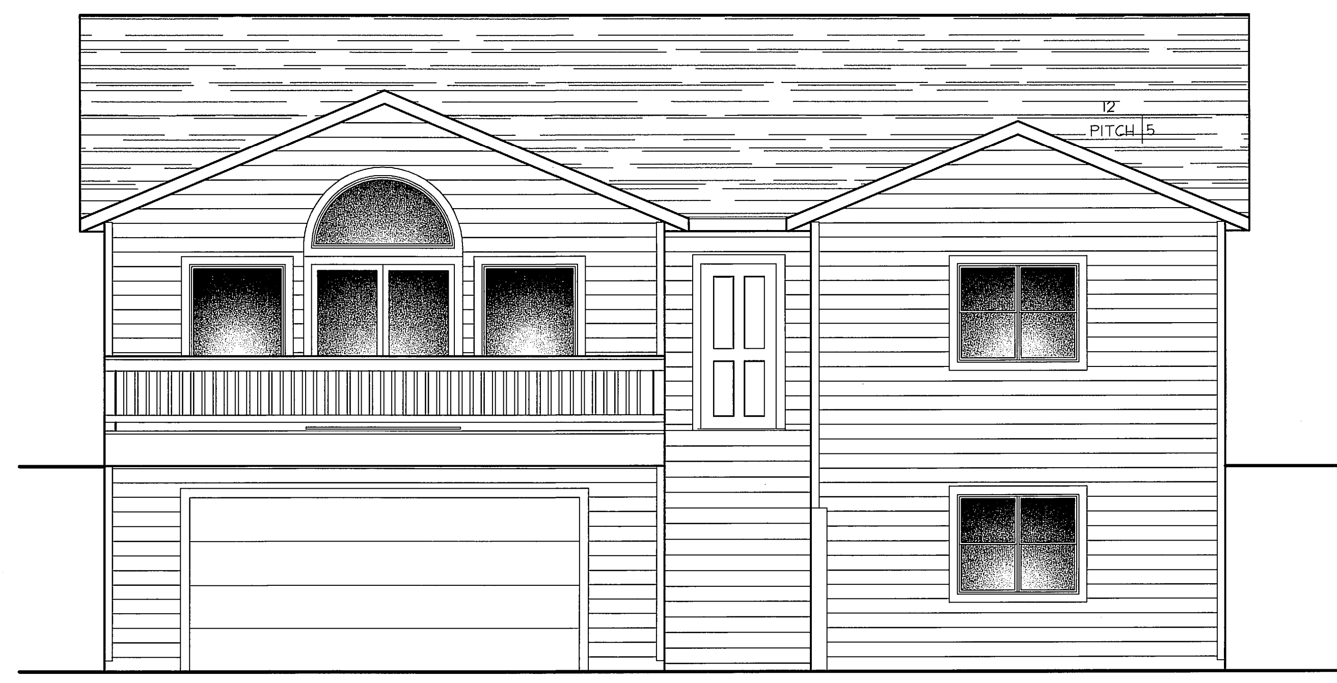
EAST ELEVATION SCALE: 1/4" = 1'-0"