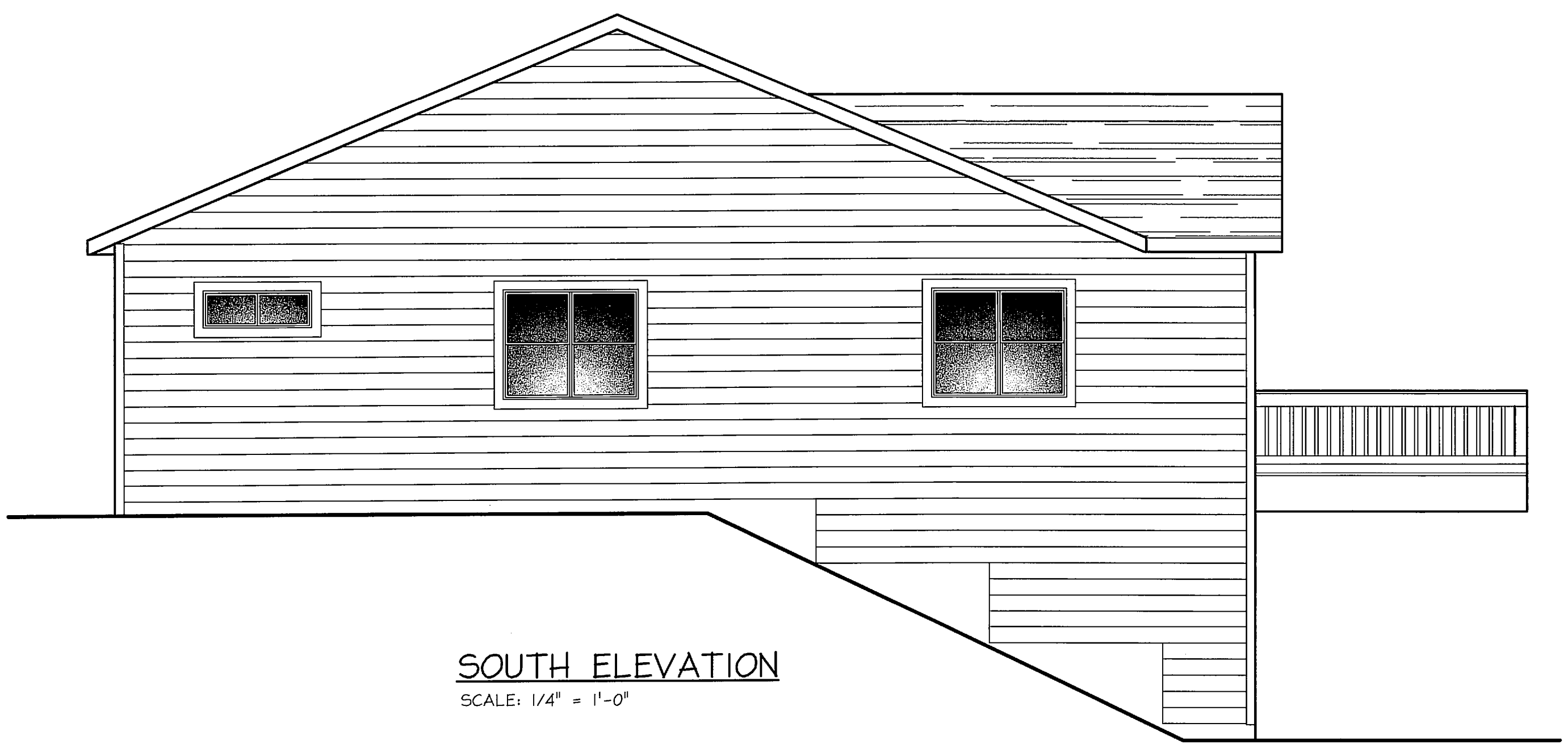
SOUTH ELEVATION SCALE: 1/4" = 1'-0"